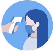
Body temperature check is required

BEFORE ENTERING The Sewing Labs(TSL) - Due to added health & safety requirements - it is required that all students arrive 10-15 minutes early and wait outside for admission to TSL. TSL has created a system of “marking” at the front entrance to maintain social distancing during check in. If you arrive late we will not be able to process you ----- “NO DRIFTING IN”